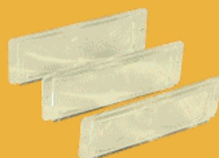
MG-1.8; MG-2.3; MG-2.7

The magnifier lenses are compatible with both the FHS/T00 goggles and the FHS/T01 miner's lamp, providing 1.8x, 2.3x and 2.7x magnification.